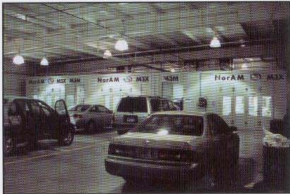
TRIPLE DRIVE THROUGH BOOTH CONFIGURATION WITH (2) INTERMEDIATE MIX ROOMS