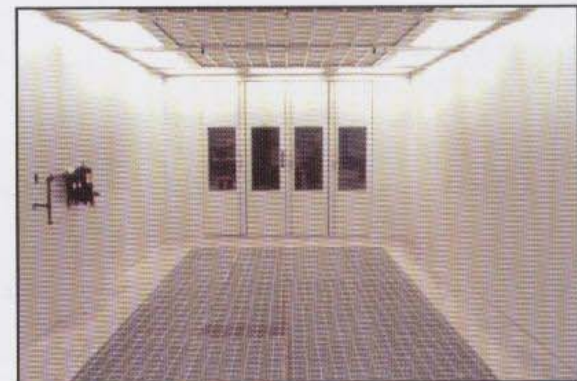
GLARE-FREE 360° LIGHTING FROM SIX-BULB FIXTURES ABOVE DOORS AND WALLS