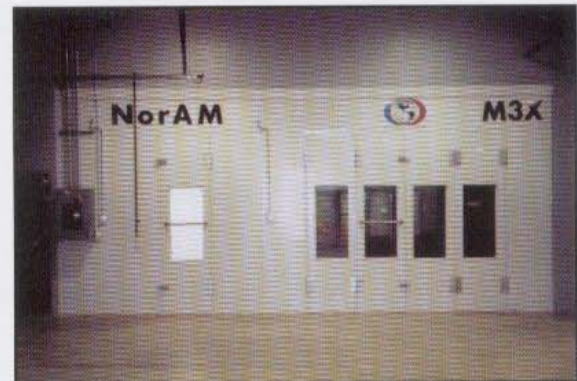
DRIVE THROUGH BOOTH WITH ADJOINING MIX ROOM AND REMOTE MOUNTED CONTROL PANEL