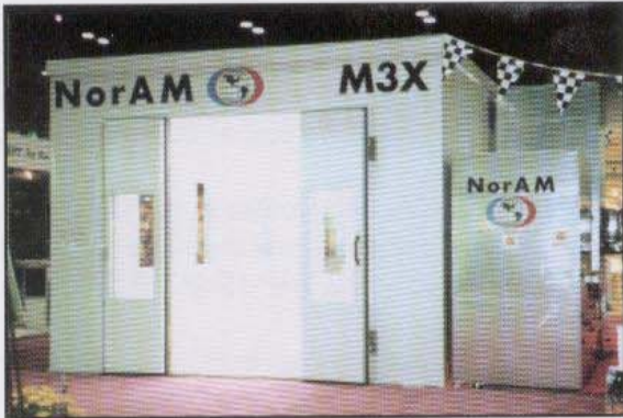
NORAM'S LIGHTING AND CUSTOM HEAT UNIT IMPRESSED NACE VISITORS