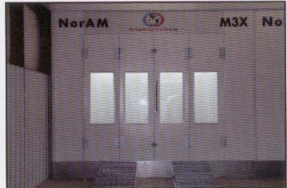
NORAM M3X BOOTH INSTALLED ON AN ABOVE GROUND METAL BASEMENT